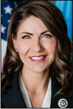
KRISTI NOEM Governor of South Dakota

Kristi Noem was elected in November 2018 as the 33rd Governor of South Dakota. She is a wife, a mother, and a lifelong rancher, farmer and small business owner. Now bringing her experiences to Pierre, Kristi is improving education and workforce training, taking on the drug crisis, improving mental health, and increasing transparency - all without raising taxes or making government too big.