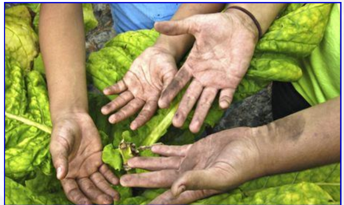
Tobacco farmworker children's hands

The current focus on child suffering has shined a spotlight on the lack of progress seen in the United States for its child workers, despite its perceived leadership in human rights. The US is not fulfilling its commitment under ILO Convention No. 182 "to take immediate and effective measures to secure the prohibition and elimination of the worst forms of child labor as a matter of urgency." Current US law allows children to work long hours in hazardous jobs, including working in tobacco fields.