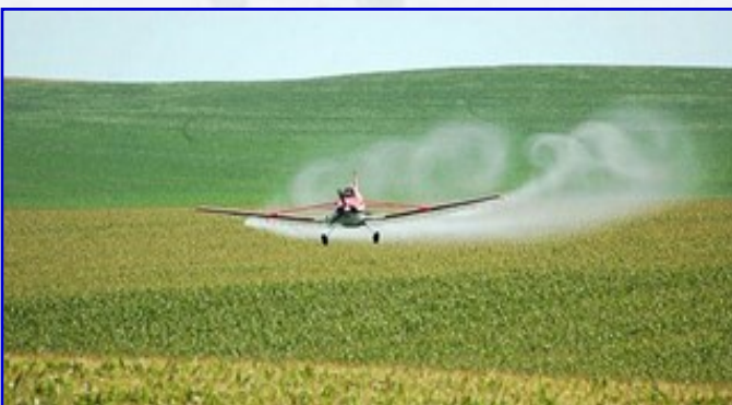
Typical crop dusting technique.

environment from potential adverse effects of off-target pesticide application. These regulations include restricting how pesticides are used, certification and training of applicators, and enforcement and compliance of pesticide laws. In late 2009 the agency rolled out new guidelines directing pesticide manufacturers to include labeling on their products indicating how to minimize off-target spray and dust drift. As of January 2012, any spray pesticide manufactured or labeled for sale in the U.S. must display this warning on its label: "Do not apply this product in a manner that results in spray (or dust) drift that harms people or any other non-target organisms or sites."