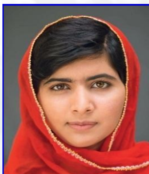
Malala Yousafzai, 2014 Nobel Laureate

Yousafzai – better known by her first name, "Malala" – was only 15 when the Taliban