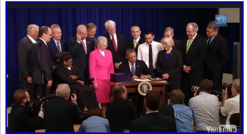
Obama signing the 2014 Workforce Innovation and Opportunity Act

This past summer, Congress passed and President Barack Obama signed into law a compromise Workforce Investment Act (WIA) reauthorization bill preserving NFJP as a national program. The bipartisan bill, called the Workforce Innovation and Opportunity Act (WIOA), includes the nation's primary programs and investments in employment services, workforce development, adult education, and vocational rehabilitation activities. The Opportunity Act takes the place of WIA and is now the law of the land for workforce systems in the states and local areas, Job Corps, national programs (like NFJP), and adult education and literacy. In addition to reauthorizing NFJP, the Opportunity Act also changes NFJP competition to once every four years, reserves funding for migrant and seasonal farmworker youth activities when appropriations for overall youth workforce investment activities exceed a set amount, and makes fish